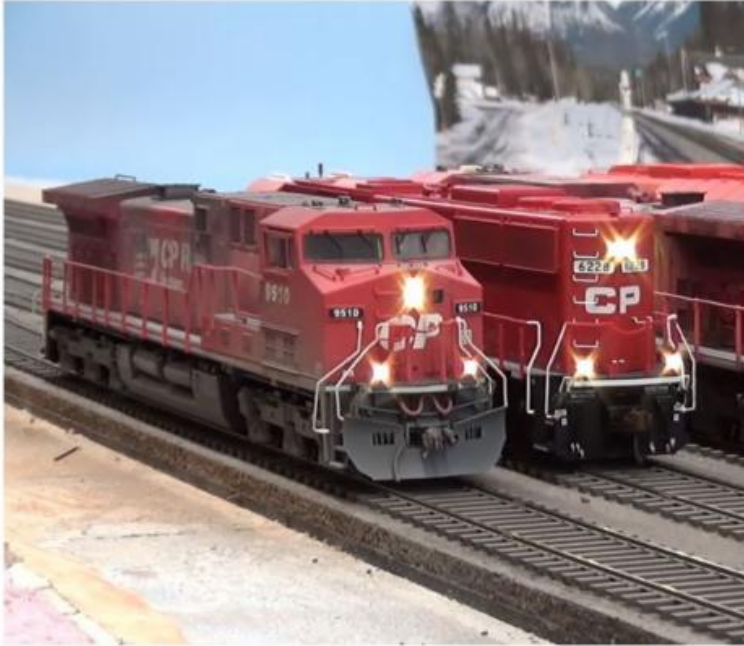
How to Solder Leads to 603 "Sunny White" LEDs

How to build a realistic road and river scene for a diorama or on your layout.