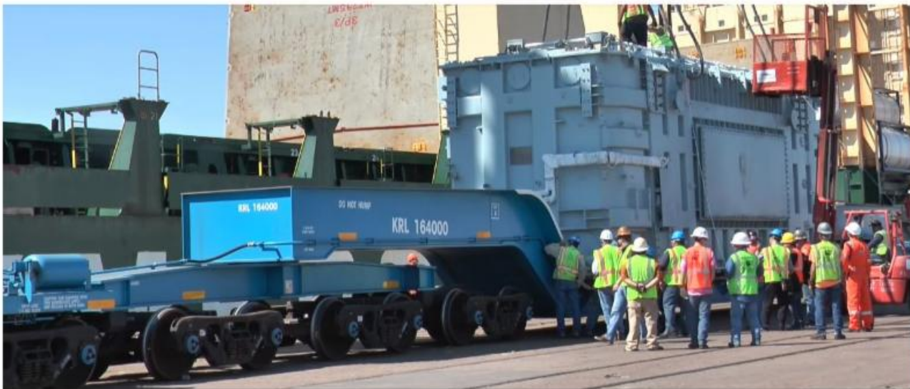
UTC Behind the Scenes of a Record-Setting Move

A video showing Railfan Models first kit, a Kasgro 325 ton depressed center heavy duty flat car. Also shown are a pair of kits to make two different transformer loads for this car.