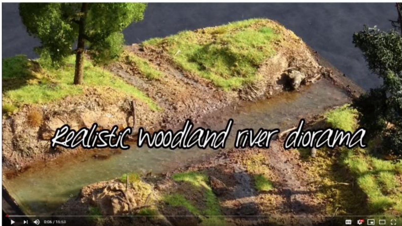
Diorama ideas - How to build realistic scenery for scale models and miniatures

You may have seen the Canadian Canyons N scale (1:160) project layout on MR Video Plus or in the pages of MR magazine (Jan 2019). Now you can learn the design insights and hear construction backstories from layout architect David Popp in this 40 minute video clinic. David provides an enjoyable overview of what it takes to bring a project layout from idea to finished model railway, and he illustrates the conversation with clips pulled from more than 60 videos that chronical the construction progress on MR Video Plus. David first shared to the Railway Modelers of British Columbia (Vancouver) in May, and the National N Scale Convention (Chicago) in June, and now NMRA members can enjoy the experience as well for free this month on MRVideoPlus.com