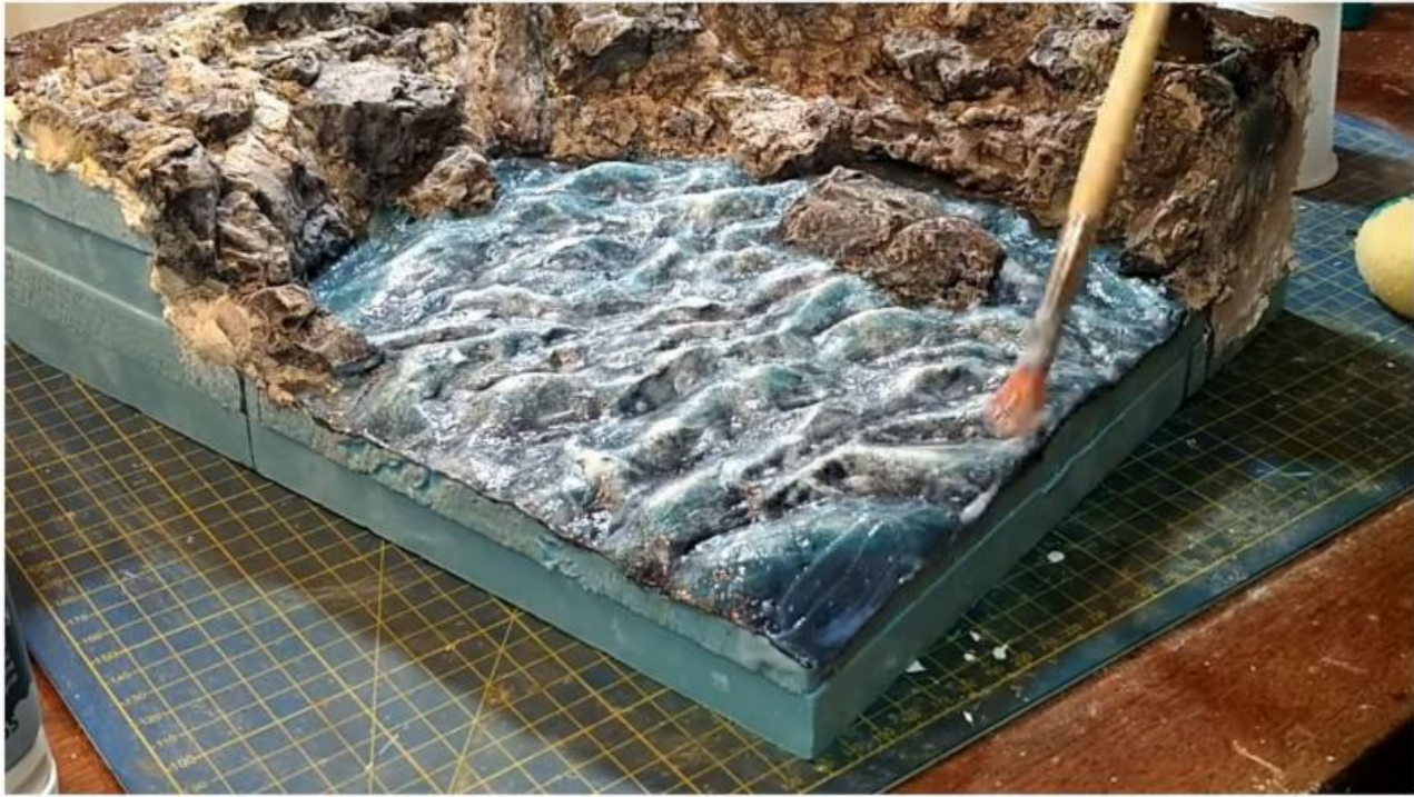
Amazing ocean diorama: how to make the ultimate realistic scene