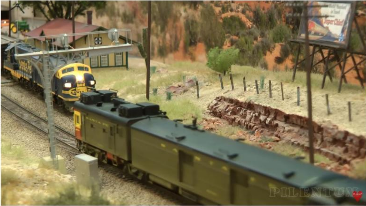
Beautiful Model Railway Layout in HO scale