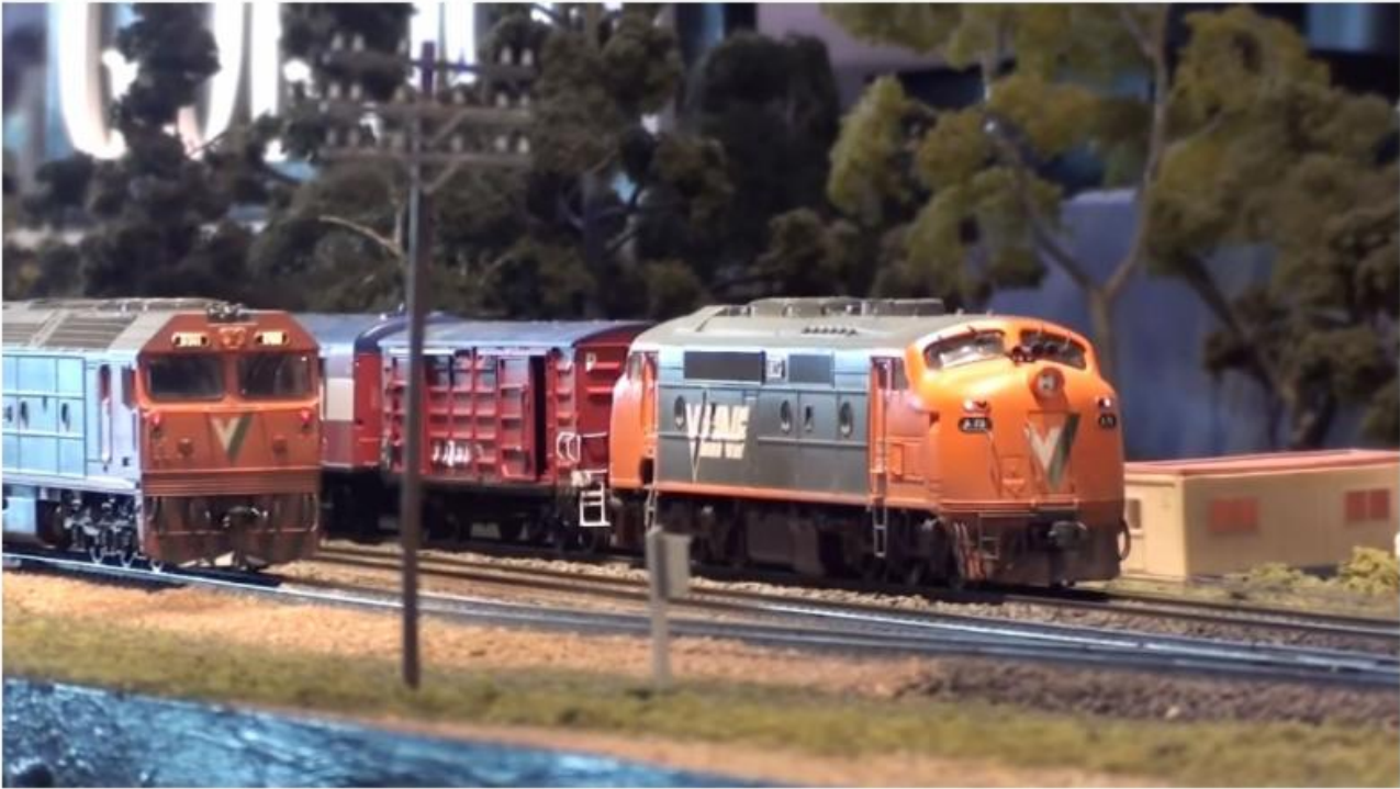
Sandown Model Railway Exhibition 2017 - Part 1 Australian Trains