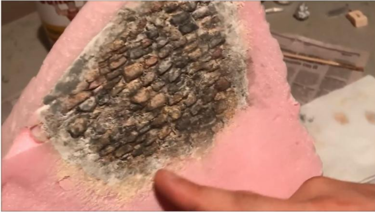
Miniature Terrain Tutorial - Realistic Stone Texture

A video showing the movement of a massive phase-shifting transformer from China to rural Utah by rail & road in 2015.