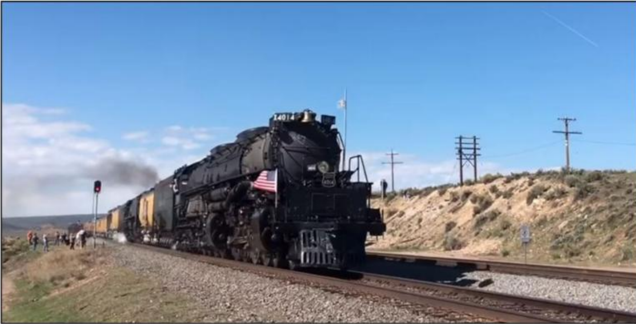
Union Pacific Big Boy #4014 & UP #844 from Ogden, UT to Rock Springs, WY