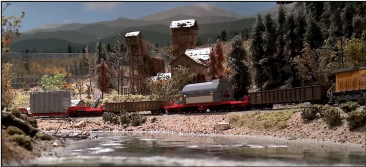
Railfan Models HO Scale Kasgro 325 Ton, 12-Axle Heavy Duty Flat Car