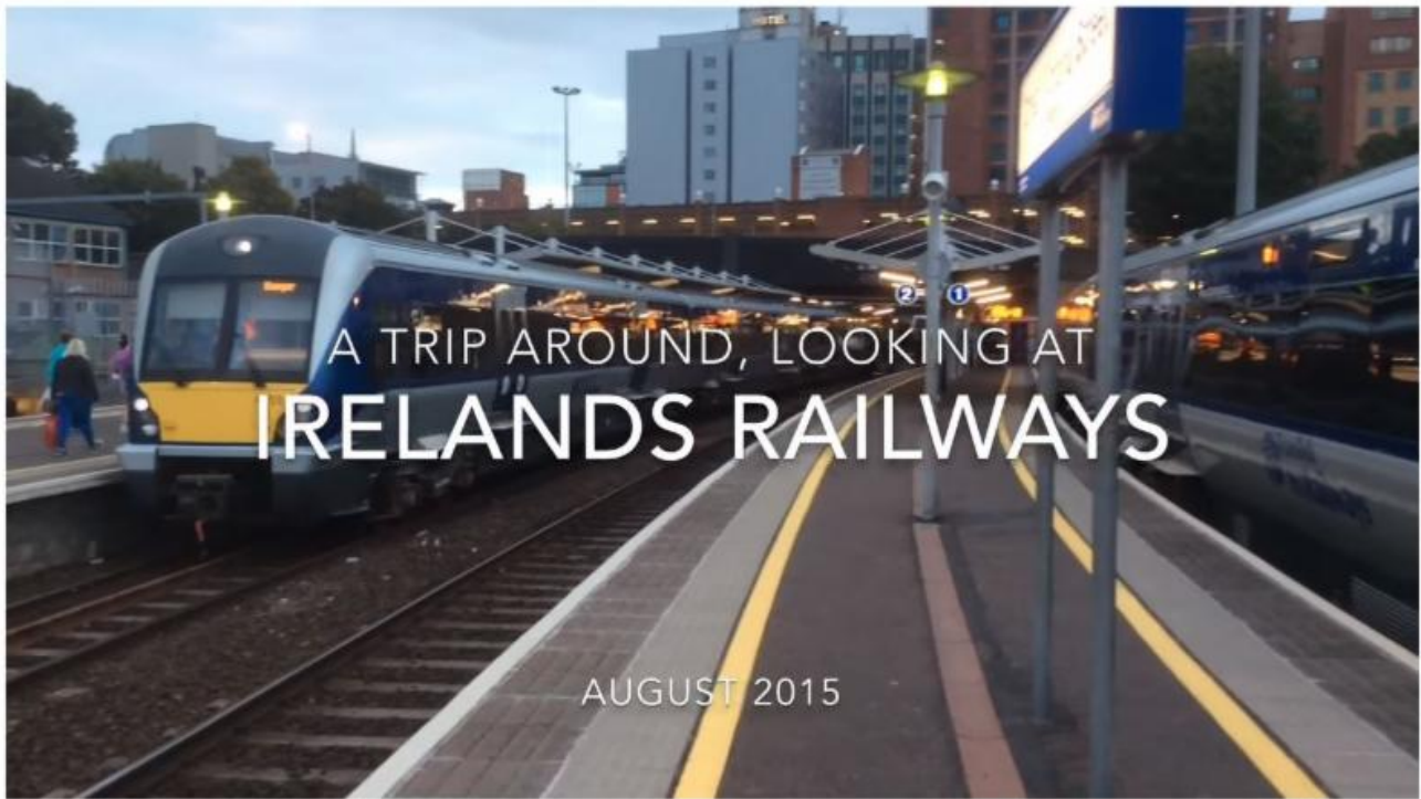
Looking at Ireland's railways August 2015